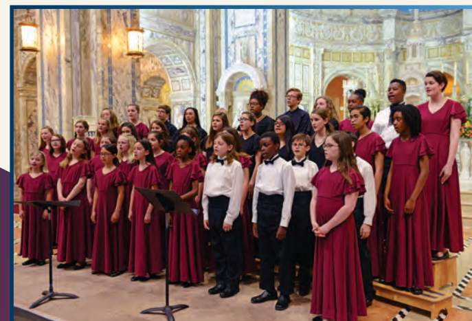
Children's Chorus of Maryland

The synergy between voice and dance will be spotlighted in Carmina Burana as we collaborate with dancers and the Children's Chorus of Maryland to bring Carl Orff's masterpiece to life in the two-piano and percussion edition.